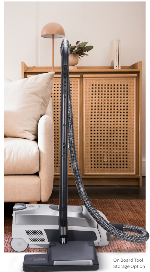
On Board Tool Storage Option

If an object becomes tangled in the power nozzle brush, the circuit breaker will automatically shut off the brush to prevent damage. A built in thermo coupler protects the motor by shutting it down if it overheats.