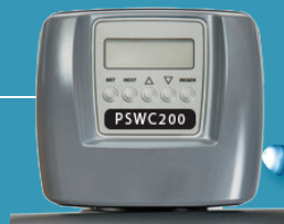
Electronic control valve by Aerus Origins™

Combination whole house water filter and water softener.